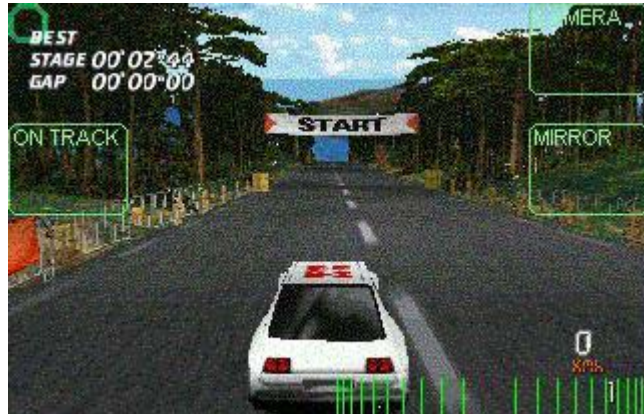
To pause game on P800, tap circle in top left corner of screen